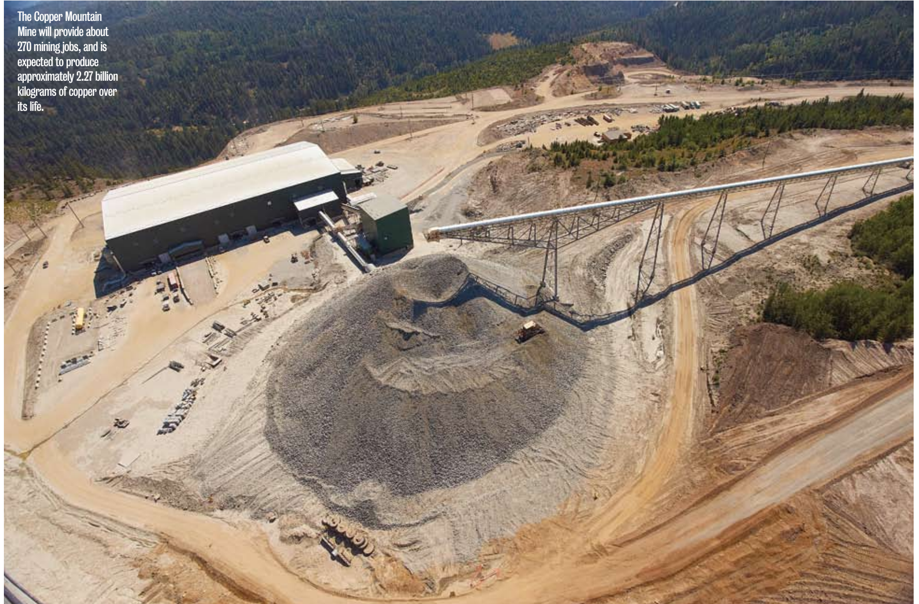
The Copper Mountain Mine will provide about 270 mining jobs, and is expected to produce approximately 2.27 billion kilograms of copper over its life.

Connect with the Province of BC at: www.gov.bc.ca/connect